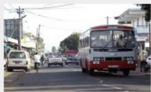
Street in Mauritius

Children living on the streets are on the increase, and Mauritius has no immunity to this enigma, the association Safire in co-operation with Mauritius Family Planning and Welfare Association outlines in a report, reckoning the conditions of street children in the island nation 6,780 children are currently on the streets, according to their recent report and this figure is likely to grow. The NGO SAFIRE SAFIRE (Service d'Accompagnement, de Formation, d'Insertion et de Réhabilitation de l'Enfant (Support Service for Training